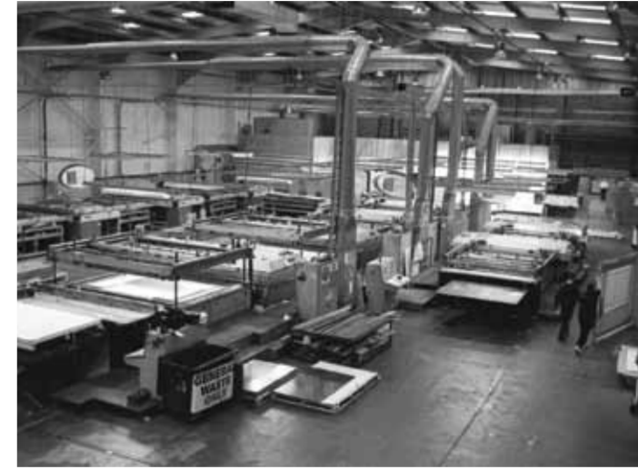
Two silk-screen printers, Capital Print and Display, 2007 Capital Print operated from Marshgate Lane and printed large-format prints and posters for hoardings.