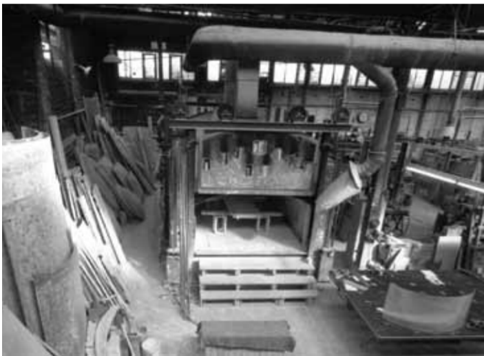
Factory floor and view of kiln, John Bowden Ltd, 2006 Established in 1800, the former John Bowden Ltd factory was situated on the edge of the Olympic site. Some kilns reach 650°C, depending on the desired curve of the glass.