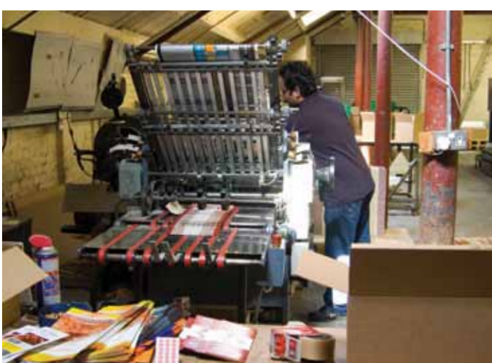
Folding Machine, MR Printers, 2007 This small printing company produced leaflets for local Indian and Bangladeshi restaurants and has relocated to Barking.