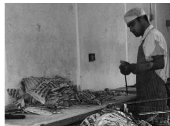
De-boning meat prior to mincing, Harringay Meat Traders Ltd, 2006 Harringay Meat Traders are wholesale butchers and doner kebab manufacturers. The company has relocated to Dagenham, Essex.