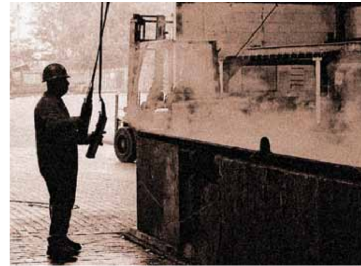
Hydrochloric acid tanks, Parkes Galvanizing Ltd, 2006 During the galvanizing process, steel is immersed into hydrochloric acid tanks and hot molten zinc at 450°C.