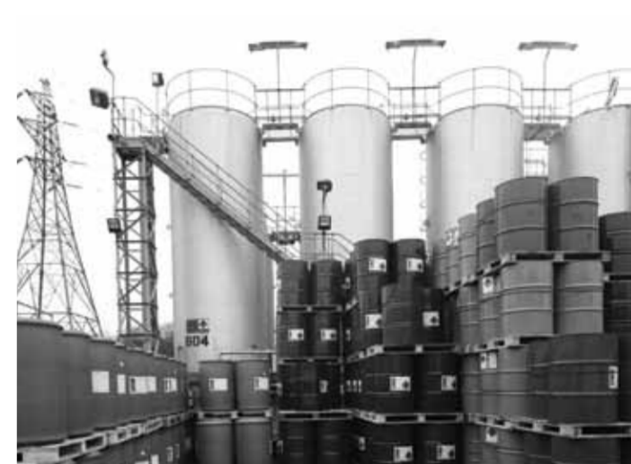
Storage tanks, Samuel Banner & Co Ltd, 2007 Samuel Banner & Co (est. 1860) supplies solvents and chemicals, and patented Turpentine ('white spirit') in 1885. Part of the Banner Chemicals Group, the company has relocated to Middlesbrough.