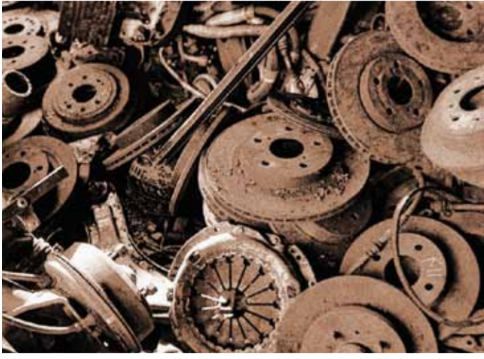
Spare clutches, JJ Autos, 2007 JJ Autos traded in car parts on Carpenters Road before relocating to South Woodford.