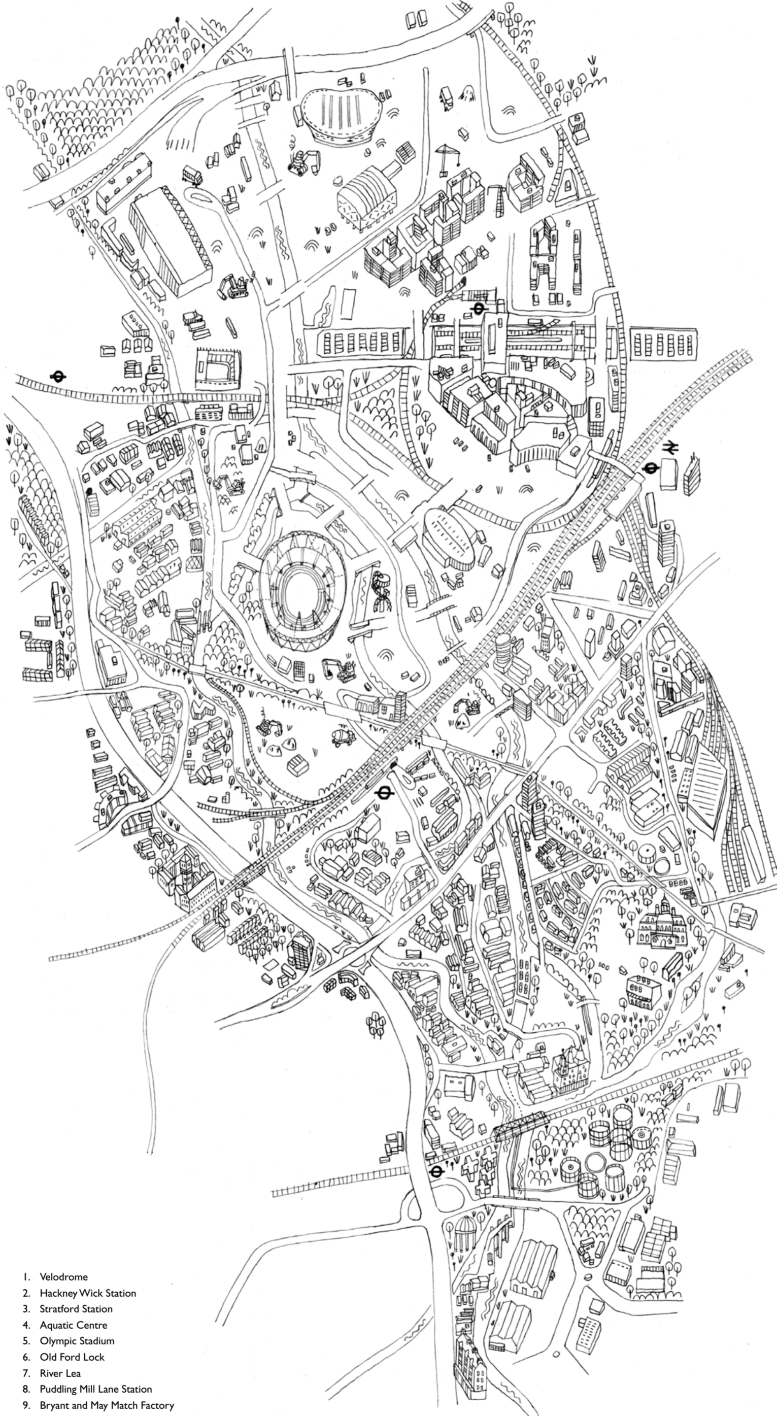
Olympic map below – as first seen in Heritage Today, March 2012.

The park that visitors see newly opened for the London 2012 Olympic Games, with state-of-the-art stadia and sports buildings, was created and built upon land that once had a distinctive industrial appearance and character. In the nineteenth and twentieth centuries, this was the heart of London's industry, although now it has all but vanished. The infrastructure of the waterways, the industrial buildings in the Fish Island Conservation Area, the Three Mills tide mills, Abbey Mills pumping station and other buildings and structures around the site survive and bear testimony to the industrial past; others have been entirely lost. As the world comes to visit a new London landscape created on top of the old, we celebrate both moments in history.