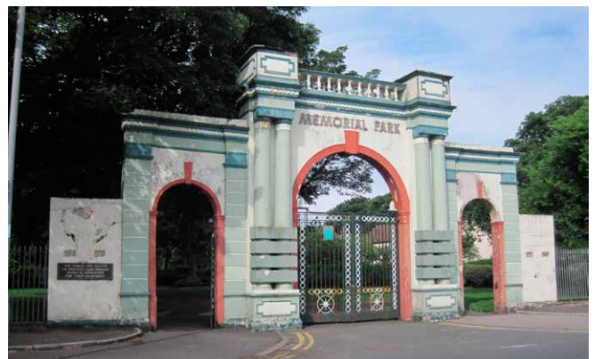
Figures 11 (top), 12 (middle), 13 (bottom)

Top: Dawley Memorial Park (Telford & Wrekin), opened in 1902 to mark the coronation of Edward VII and rededicated as a memorial park after the First World War. A prominent display of the commemorative function is characteristic of memorial park entrances. Middle: View of the Grade II-listed gates at Ashbourne Memorial Park, Derbyshire, which was opened in 1922.