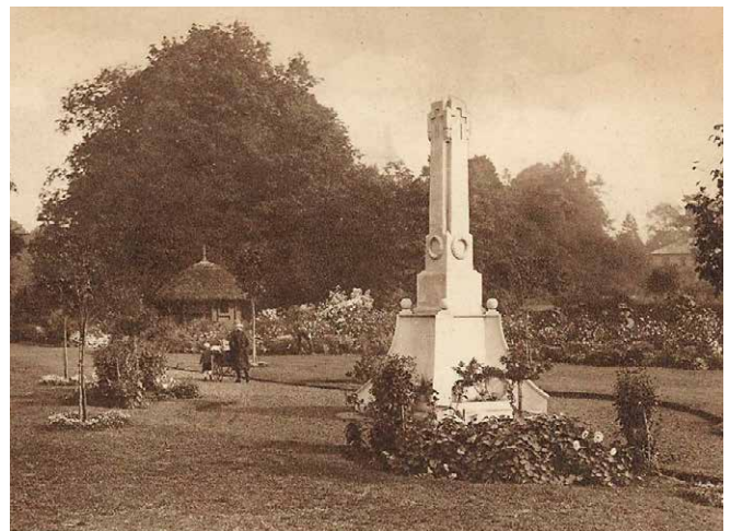
Figure 10 An early view of Romsey Memorial Park (Hampshire), opened in 1920; the Grade II-listed war memorial was unveiled in 1921. As the principal park in the town it contained most of the amenities associated with a typical public park.