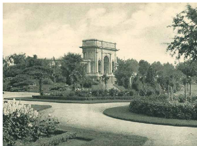
Figure 2 Nottingham Memorial Gardens. The Grade II-registered gardens are only the core of the memorial landscape, most of which comprises playing fields for the neighbouring schools. The Memorial Arch, unveiled in 1927, is Grade II-listed.

While, as will be seen, most war memorial parks and gardens originated after the First World War, a significant number were also created as Second World War memorials. In this advice, the emphasis is on designed landscapes created after the end of the First World War, although it does look ahead to what happened after later conflicts. Brief notice is also given to wider memorial landscapes, although the topic lies beyond the scope of the present document.