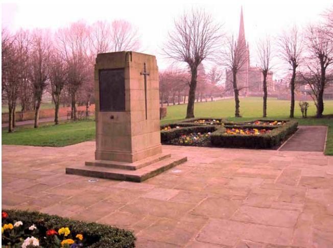
Figure 9 The Memorial Park at Kirkham, Lancashire, on which Thomas Mawson advised. This has a strong formal design with an axial walk aligned on the church spire.

A memorial park often grew from a pre-existing aspiration for a public park. In Romsey in Hampshire, a park had been discussed for many years before the First World War, and the end of the War gave the campaign fresh impetus under the banner of commemoration. What was laid out was a traditional public park of some 2ha. complete with bandstand and ornamental planting (Fig10). Negotiations to purchase the estate which became Gheluvelt Park were opened as early as 1912, while the Memorial Park at Herne Bay in Kent was created on a site where a park had first been proposed in 1894. In other cases, as at Kirkham, a pre-existing park was adopted as a memorial. At Chingford in Essex, the Memorial Park was laid out in 1930 around the pre-existing war memorial garden. The site was extended to some 3.8ha. and became the Urban District Council's first municipal park, with a range of amenities including a bandstand and ornamental pond as well as sports pitches and a bowling green.