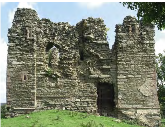
Figure 5 Hopton, Shropshire: a small castle with a late 13th or early 14th century tower built in imitation of a Norman Great Tower.

The castle retained its importance into the late medieval period, as a seat of lordship and political power base. New castles were built, often on an elaborate quadrangular plan and on a grand scale, as at Bodiam (East Sussex; Figure 4) and Bolton Castle (North Yorkshire). These castles had the symbols of military power – curtain walls, moats, and towers with arrow loops – but military needs were often sacrificed to the demands of more comfortable living, with large windows, and thinner walls allowing larger rooms. It could