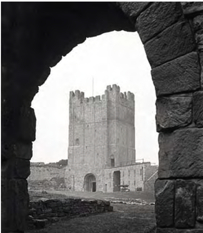
Figure 1 Richmond castle, North Yorkshire. The Great Tower, over 30 metres high, was begun by Earl Conan before 1171 and completed by Henry II.

The heart of nearly any castle of the 11th to 13th centuries was the Great Tower (or 'donjon', often referred to in modern literature as the 'keep'). Usually square or rectangular in plan, though sometimes polygonal or round, this was the principal 'symbol of lordship', physically dominating its surroundings by its height, bulk and architectural brutalism (Figure 1). It would usually contain, on an upper floor, a presence chamber where the lord would sit to receive petitioners and dispense justice. The residence of the lord and his family might be here but would usually be supplemented by accommodation in other towers or buildings in the castle, usually comprising a hall and private chambers.