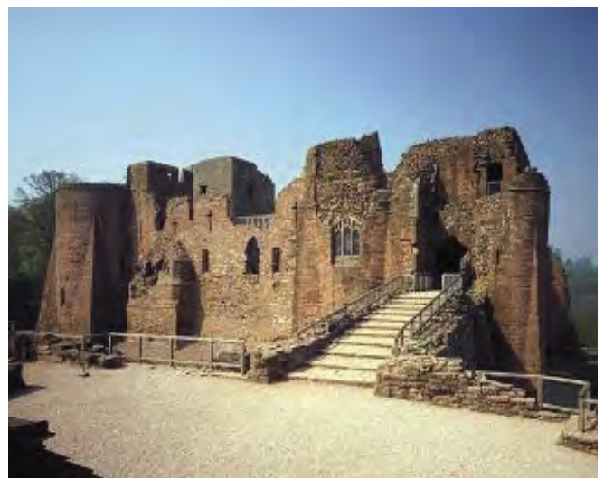
Figure 6 Goodrich Castle, Herefordshire. View from the barbican with the gatehouse, containing chapel and constable's quarters, in the foreground.

From the late 14th century onwards there was a revival of the Great Tower, with many elaborate new examples, such as Old Wardour (Wiltshire) or Tattershall (Lincolnshire) being built. Though these often contained deliberately old-fashioned elements, harking back to the glories of a heroic past, they were designed for comfortable living and grand entertaining rather than for military purposes (Figure 6). At Ashby de la Zouch (Leicestershire), prominent castellated elements including a great tower were added to an earlier, apparently unfortified manorial complex. But increasingly, from the 15th century great lords abandoned military architectural elements altogether and built grand houses round extensive courtyards, like Haddon Hall (Derbyshire) and Dartington Hall (Devon).