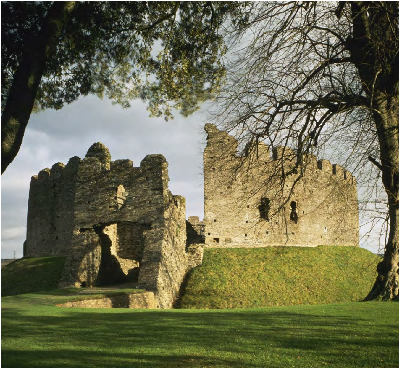
Figure 2 The late 13th century shell keep at Restormel Castle, Cornwall.

Towards the end of the 13th century and for much of the 14th, the Great Tower declined in status and few new ones were built. Instead 'enclosure' castles with no dominant tower were built. The most sophisticated of these were 'concentric' castles, with the emphasis on closely-spaced double lines of curtain walls, where bowmen on the inner wall and its towers could cover defenders on the lower outer wall (Figure 3). This defence in depth was very effective, though no castle was ever impregnable to a really determined attacker.