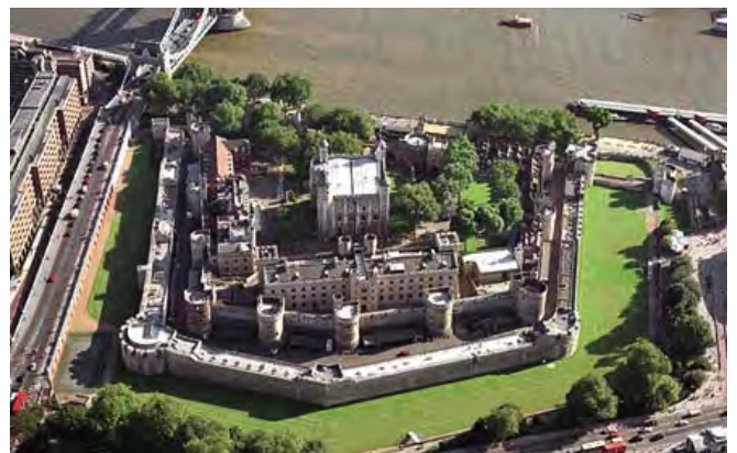
Figure 3 A concentric castle, the Tower of London.

Towards the end of the 13th century and for much of the 14th, the Great Tower declined in status and few new ones were built. Instead 'enclosure' castles with no dominant tower were built. The most sophisticated of these were 'concentric' castles, with the emphasis on closely-spaced double lines of curtain walls, where bowmen on the inner wall and its towers could cover defenders on the lower outer wall (Figure 3). This defence in depth was very effective, though no castle was ever impregnable to a really determined attacker.