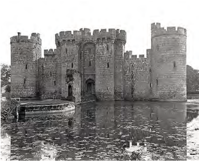
Figure 4 Bodiam, East Sussex. A small quadrangular castle of the later 14th century. How much this was intended as a defensible castle, rather than an old soldier's show-home, remains debated.

The castle retained its importance into the late medieval period, as a seat of lordship and political power base. New castles were built, often on an elaborate quadrangular plan and on a grand scale, as at Bodiam (East Sussex; Figure 4) and Bolton Castle (North Yorkshire). These castles had the symbols of military power – curtain walls, moats, and towers with arrow loops – but military needs were often sacrificed to the demands of more comfortable living, with large windows, and thinner walls allowing larger rooms. It could