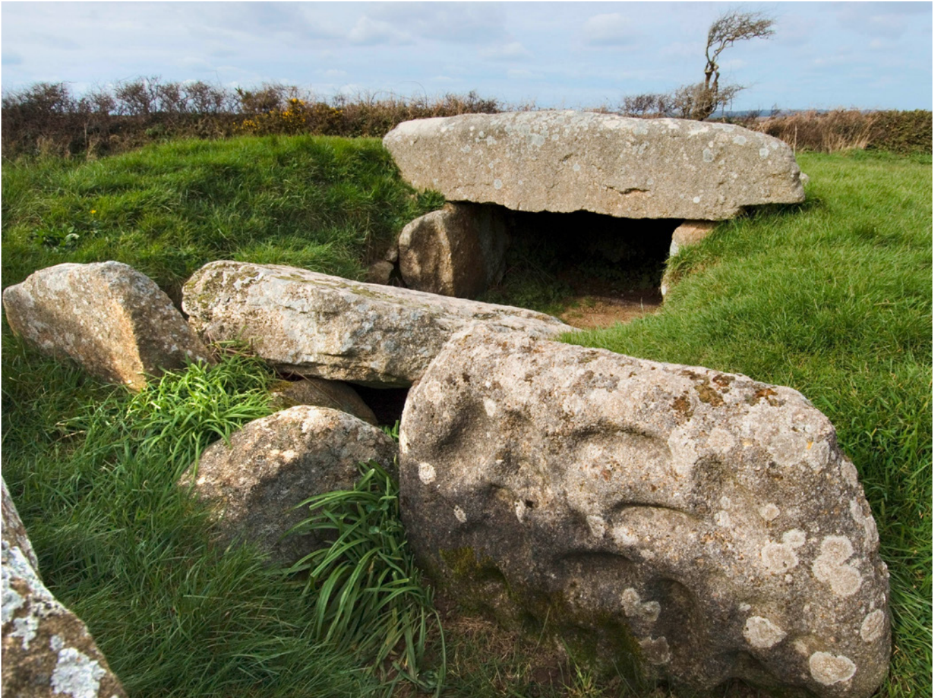
Figure 4 An entrance grave with façade (including a cup-marked stone) set into a cairn at Tregiffian in west Cornwall.

there are six, three on each side. Some, such as Waylands Smithy in Oxfordshire, take on a cruciform shape with a single transept on each side of the passage. Here and in other places, upright stones set at right angles separate the entrance passage and restrict access to the chambers.