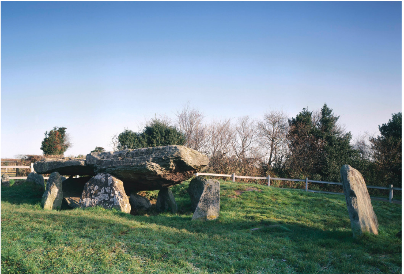
Figure 2 Arthur's Stone, Herefordshire. Note the two portal stones set at right angles to the axis of the chamber. The leaning stone on the right may have formed part of a cedilla or passage.

known are massive monumental versions such as Arthur's Stone, at Dorstone in Herefordshire (Figure 2), which has two large orthostats at one end placed at right angles to the axis of the tomb that form the 'portal', with a third orthostat marking the terminal, all supporting a massive capstone almost 6m long. Closer inspection reveals the presence of further stones that may once have formed a façade or cedilla along with the remnants of a cairn.