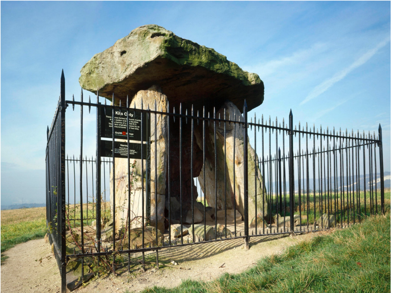
Figure 3 Remains of a burial chamber known as Kit's Coty House, near Maidstone in Kent. This was once encased in a massive long mound of chalk.

Variations in the configuration of the setting of exposed chambers can be found. At Kit's Coty House, in Kent (Figure 3), uprights reach almost 2.5 m and form an H-shaped arrangement surmounted by a large slab.