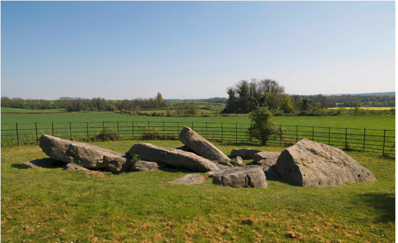
Figure 1 The tumble of large fallen sarsen stones, Little Kit's Coty, near Maidstone in Kent, is thought to have once formed a burial chamber similar to others nearby.

It might be expected from this that megalithic tombs occur mainly in those areas where stone is abundant. For the most part this is so, and Cornwall, Devon, Herefordshire, the Cotswolds and Derbyshire figure prominently on distribution maps of these monuments. However, limestone and sandstone blocks occur further afield,