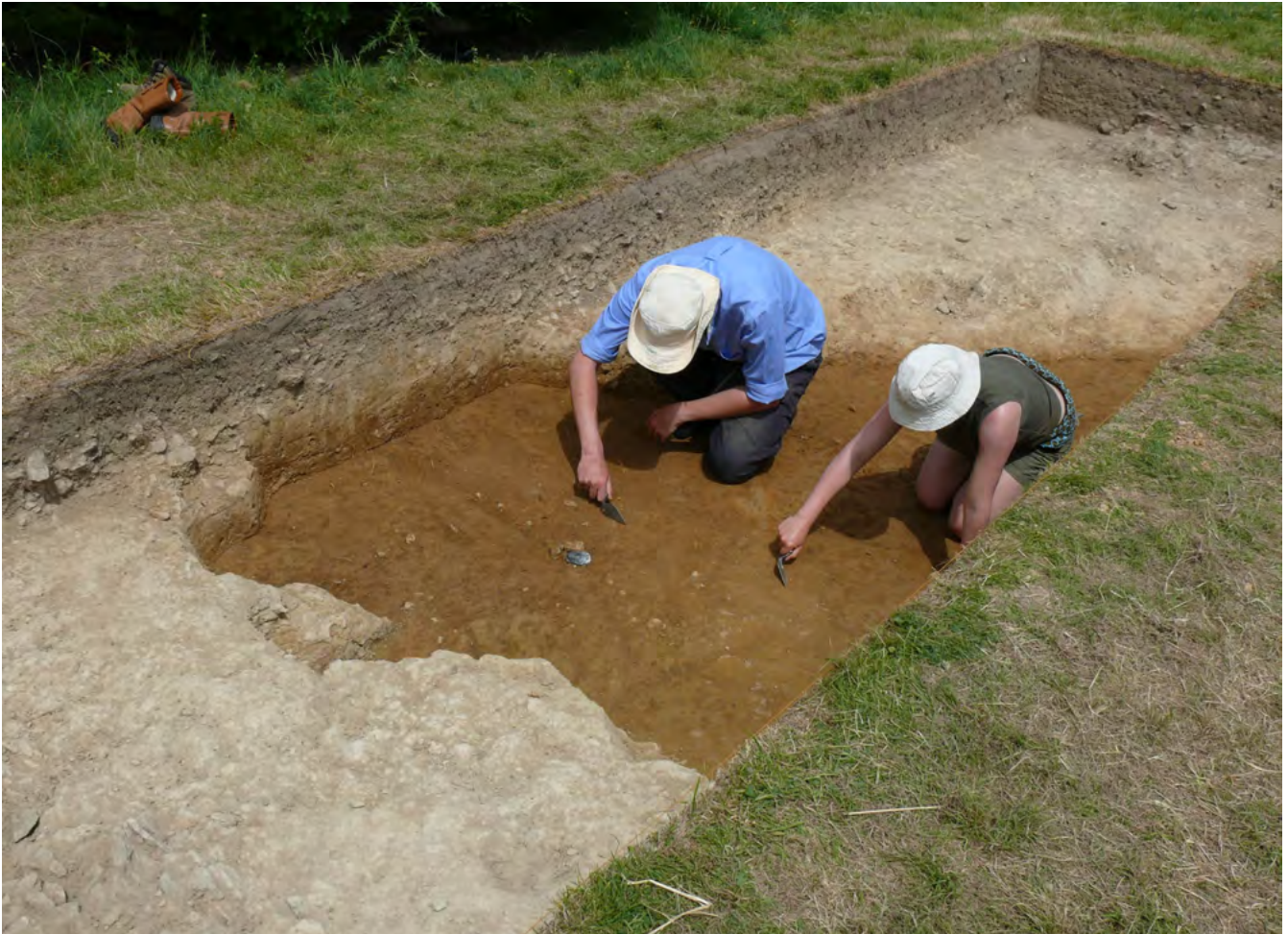
Figure 7 Excavation in progress of a 'gull' or fissure in Lower Greensand rocks (Hythe and Folkestone Beds) at Beedings, West Sussex, infilled by Holocene and Pleistocene sediments. The latter were shown to contain very rare Early Upper Palaeolithic and Middle Palaeolithic flint artefacts.

Deliberate deposition of Neolithic and Bronze Age human remains and artefacts in caves, and especially fissures (such as the Mendip swallets, or the North Yorkshire Windypits) perhaps mirror depositions in artificial pits and monuments elsewhere in the landscape. Later still, other associations include use of caves mainly as places of shelter, as in the Roman period, although they were also occasionally the sites of hoarding, workshops and craft activities. The increasing evidence for post-Roman activity – which may exceed that from prehistory in many instances – remains difficult to assess because of the incomplete or confused archaeological record.