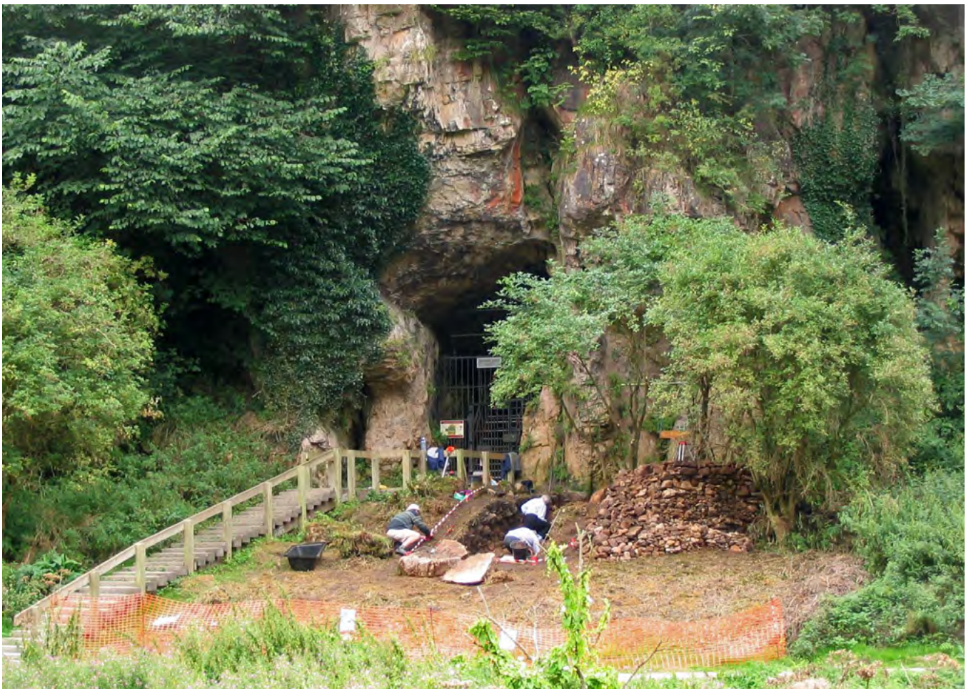
Figure 3 Archaeological excavation being undertaken at the entrance to Church Hole Cave, Creswell Crags, on the border between Nottinghamshire and Derbyshire, 2006.

Stone artefacts indicative of a Neanderthal presence (and dating approximately 40,000 – 50,000 years ago), are known from caves such as Hyena Den (Cheddar, Somerset), several caves in the Creswell gorge (Derbyshire; Figure 3), and at the rockshelter site of Oldbury (Kent).