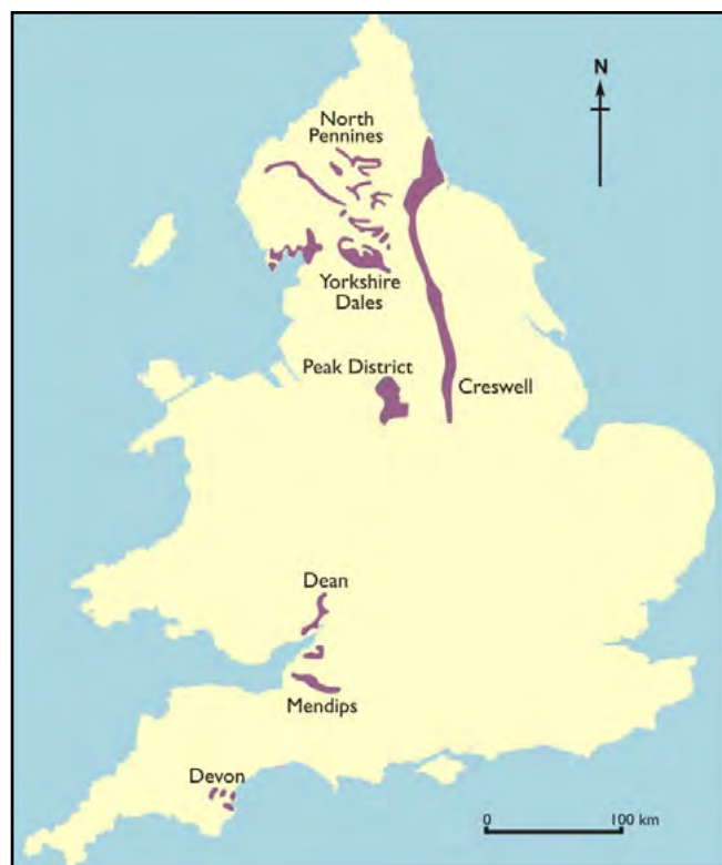
Figure 1 A map showing the main areas of karst landscape, where most limestone caves are found (England only).

Some types of fissure, not associated with caves, are caused by the vertical fracture of rock layers as they adjust to mechanical weakness or mass movement in underlying or adjacent rocks,