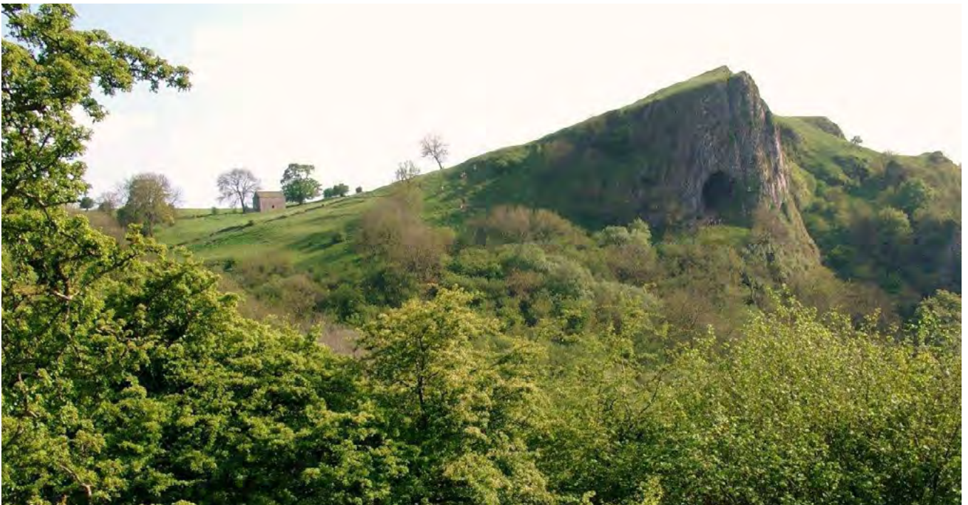
Figure 4 A prominent landscape feature: Thor's Cave, Manifold valley, Staffordshire. Finds from early excavations here and in the nearby fissure include human remains, and artefacts dating from the late Palaeolithic to at least the Romano-British period.

Victorian 'antiquarian' investigation of such complex sites, whilst conducted within the spirit and intellectual climate of the time, was nonetheless hugely destructive of deposits that – were they available to modern science now – would be rated of the highest value and significance (Figures 4 and 5). The explorations that followed in the earlier part of the 20th century were much more measured and formalised although still on a scale and to standards that would not be acceptable today.