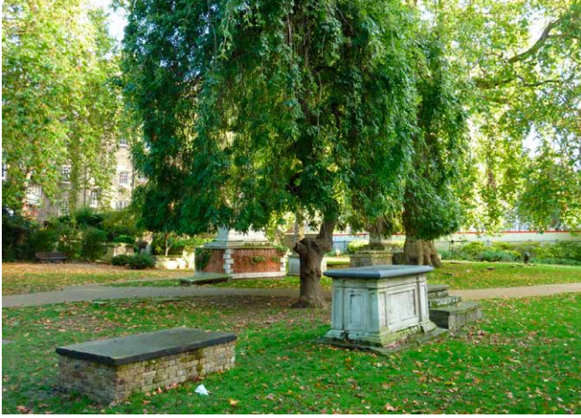
Figure 2 St George's Gardens, London Borough of Camden. Opened in 1713, this was a new kind of Anglican burial ground – a suburban cemetery along the Roman model of being situated on the edge of the city, in the pasturelands of Bloomsbury. Registered Grade II*.