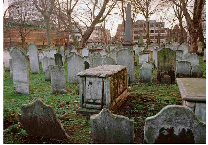
Figure 3 Bunhill Fields, London Borough of Islington. One of the capital's earliest, and historically richest, nonconformist burial grounds. Interment here was started in 1666, and there are now some 2,000 memorials. Seventy-five tombs, along with the boundary walls, railings and gates, are listed at Grades II* and II. The whole is registered at Grade I.

a consequence of investment in complex memorials, which used up space in the churchyard rapidly, and partly because of population growth.