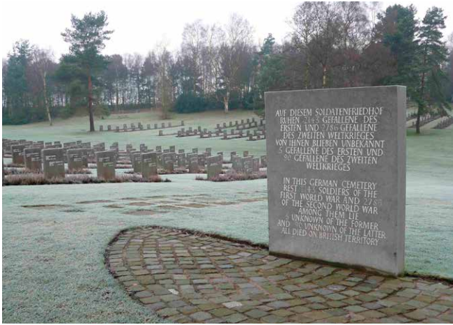
Figure 10 The German Military Cemetery on Cannock Chase, Staffordshire. Opened in 1967, the location, with its silver birches and heather, deliberately resembles a North German heath landscape. It contains the remains of 5,000 German nationals who died during the two world wars. Registered Grade I.