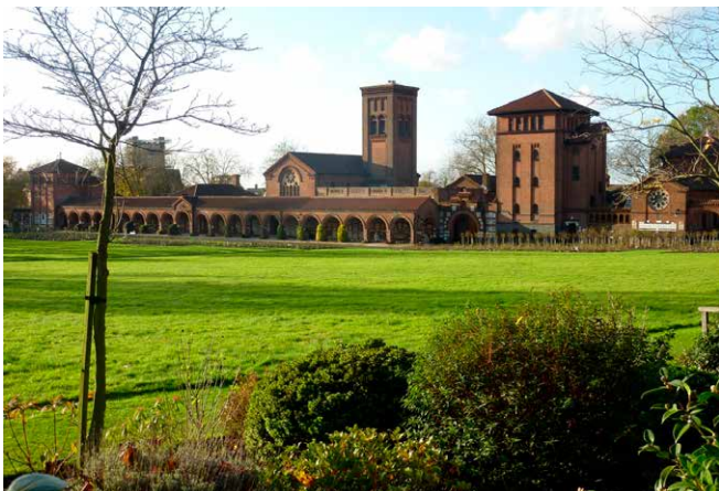
Figure 8 Golders Green Crematorium, London Borough of Barnet. Opened in 1902, it remains the most important example of a crematorium landscape, in which individual memorials are subservient to the elemental terrain of earth and sky. William Robinson advised on the lay-out. Registered Grade I.

Cremation was legalised in 1884, the first legal cremation took place in 1885, at a crematorium founded by the Cremation Society of Great Britain, at Woking (Surrey; Grade II). An Act of 1902 empowered the construction of crematoria by local authorities. Hilary Grainger's Death Redesigned records that to 2005, 251 crematoria were built in the UK: 14 to 1914, 6 in the 1920s, 34 in the 1930s, and 4 in the 1940s. Between 1950 and 1970 a further 147 were constructed. Golders Green, opened 1902 (London Borough of Barnet; registered Grade I; Fig 8) is the first crematorium in England where landscape design was considered from the outset, and it had significant influence on crematorium landscape design in general right through the first half of the twentieth century although, as the figures above show, it was only in the 1930s that crematoria began to be built in larger numbers. William Robinson's God's Acre Beautiful (1880) was a key tract, promoting both cremation, and burial grounds entirely uncluttered with memorials or tombstones. The American term 'gardens of rest' or 'gardens of remembrance' has been in