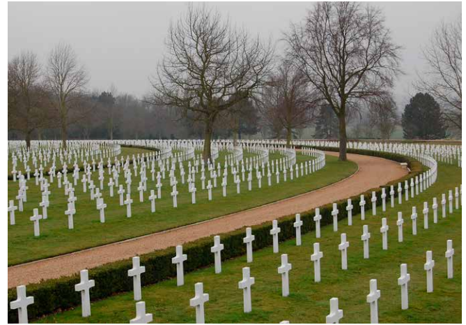
Figure 11 The American Military Cemetery, Madingley, Cambridgeshire. The only permanent American Second World War cemetery in Britain, dedicated in 1956. Many young airmen are buried here, and the cemetery – with a dedicated viewing platform at one corner – overlooks the flat ‘bomber country’ they flew over. Registered Grade I.

use since the 1920s. They are interchangeable and usually describe either the entire grounds surrounding a crematorium or a specific area within more extensive cemetery grounds.