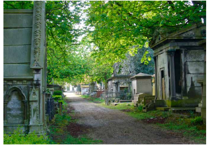
Figure 5 Kensal Green Cemetery, Royal Borough of Kensington and Chelsea, London. Opened in 1833, this is the oldest of the ‘Magnificent Seven’ private cemeteries which served London. Some 250,000 people are buried here, including 550 who appear in the Oxford Dictionary of National Biography . Registered Grade I.