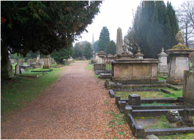
Figure 4 Histon Road Cemetery, Cambridge. Although this has lost its chapel, it is included on the Register at Grade II as the best example of a cemetery designed by J C Loudon (d.1843), the leading proponent of cemetery improvement. Typical features include the straight paths, neatly-ordered graves and sombre planting.