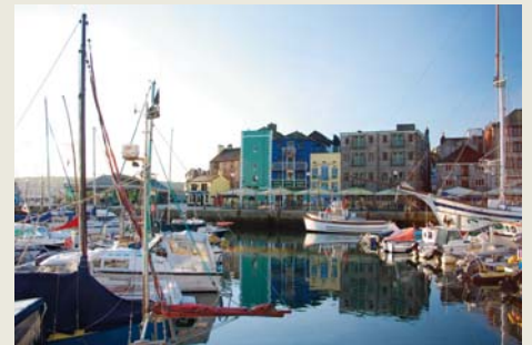
Image Plymouth Barbican looking towards Quay Road