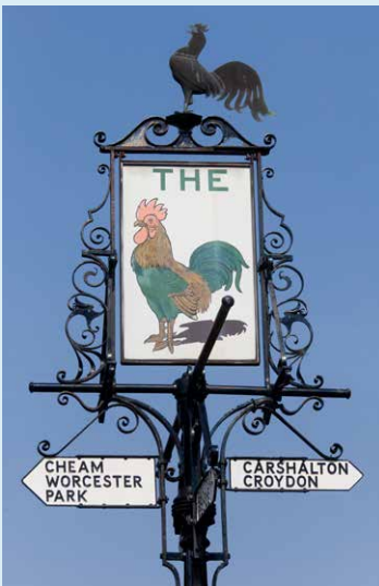
The Cock sign has stood at the top of Sutton Town Centre High Street since the 1930s, originally advertising The Cock Hotel.

Research commissioned for Heritage Counts 2017, to commemorate the 50th anniversary of conservation areas, employs a novel approach to analysing trends in conservation areas by benchmarking performance against matched non-conservation areas (OCSI et al , 2017). The research provides a comprehensive review of conservation areas nationally, using spatial data and national statistical indicators over time and particularly looked to understand trends in conservation areas in terms of 'good growth'. Head to the website for the full report .