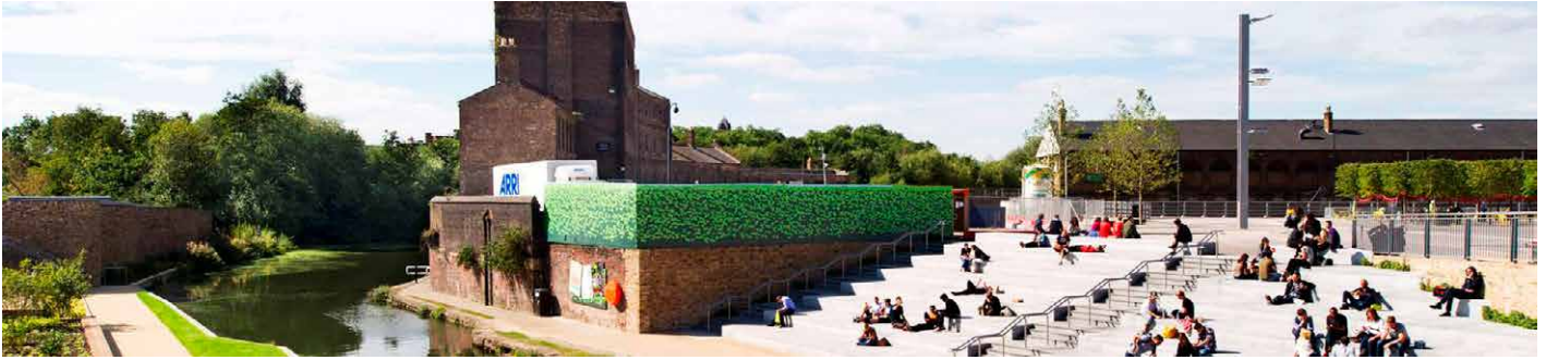
Image: King's Cross is an example of Good Growth, re-using heritage assets and respecting the character of the Conservation Area.