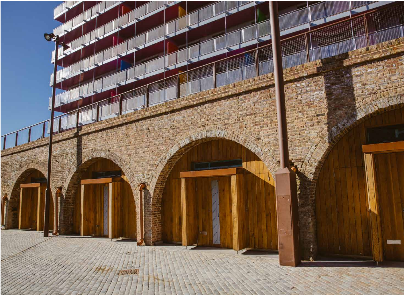
Image: The Deptford Project, situated in the Deptford High Street Conservation Area, puts the restoration of built-heritage at the heart of a mixed-use residential-led regeneration scheme and features in the Historic England Translating Good Growth for London's Historic Environment report.

This Heritage Counts 2017 Regional Report is edited by Rachael McMillan and produced by Historic England on behalf of the London Historic Environment Forum (London HEF). London HEF comprises the following organisations: