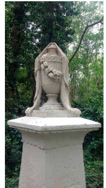
Image: This beautiful monument to Joanna Vassa at Abney Park Cemetery has been saved and removed from the Heritage at Risk Register.