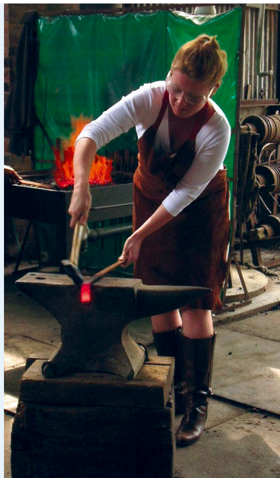
A student on the Ironbridge Institute's Metals course using a blacksmith's forge

www.ironbridge.org.uk/assets/Uploads/170913CPDTrainingCourses2.pdf