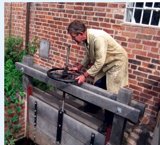
Above and below: volunteers at work at Sarehole Mill in Birmingham