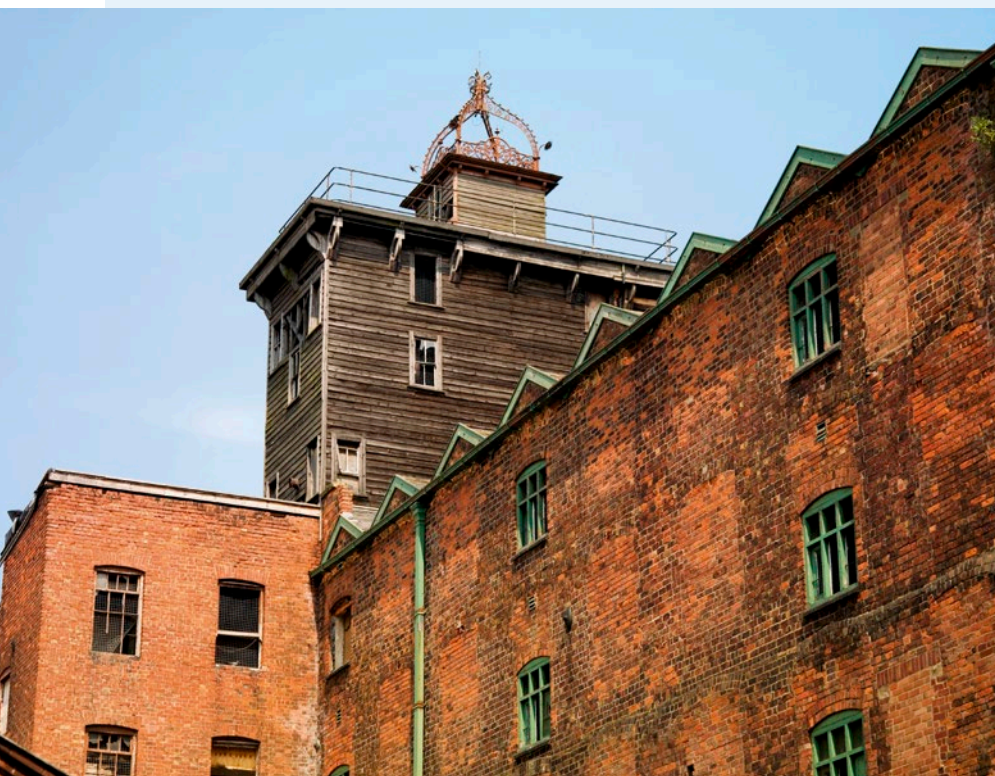
Ditherington Flax Mill in Shrewsbury

Heritage Counts 2013 has been produced by English Heritage on behalf of the West Midlands Historic Environment Forum: