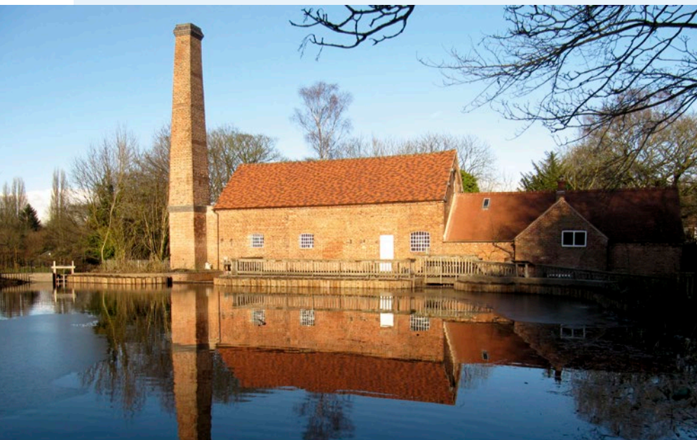
Sarehole Mill and its mill pond, in Birmingham

compare notes, discuss milling and keep a written log, as well as an online blog at www.sareholemillers.wordpress.com . An account of the project has also been added to the Birmingham Archives & Heritage blog at www.theironroom.wordpress.com .