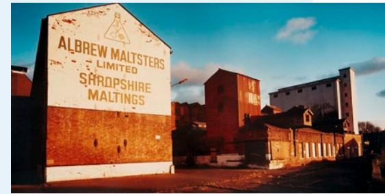
Ditherington Flax Mill in Shrewsbury

www.ditheringtonhlf.info/ www.flaxmill-maltings.co.uk