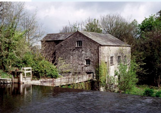
Heron Corn Mill taken from Images of England website. © Mr Adrian Allchin. Source English Heritage

The current Heron Corn Mill is an 18th-century collection of buildings, in Beetham, Cumbria which probably replaces much earlier mills on this site. The grade II* listing reflects the national importance of both the mill and its associated structures such as the attached mill race, grain kiln/dryer and internal machinery – and the fact that it is a relatively intact, operational corn mill that continues to be powered by water.